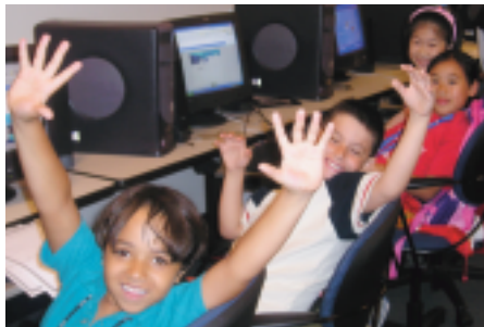
Young people in the technology lab learn new skills.

The summer program began bright and early each day at 8:30 AM when children and teens arrived at the Club for