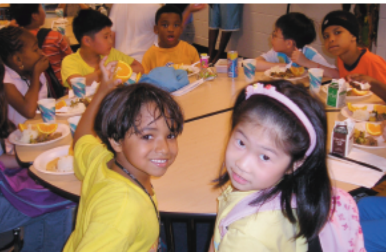
Lunchtime! Children enjoy a healthy meal at the Club's summer program.

T he New Balance Foundation has recently awarded a $240,000 grant to the West End House Boys & Girls Club to support an exciting initiative for neighborhood youth. The program is called Kids in Motion and is a Club-wide fitness and nutrition strategy designed to help youth and their families achieve a healthy lifestyle. Nutrition classes, daily fitness challenges, family activities, and life skills programs will begin this fall after a community celebration here at the Club. Read more about it in the next edition of Club News!